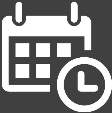
Programme 8 weeks